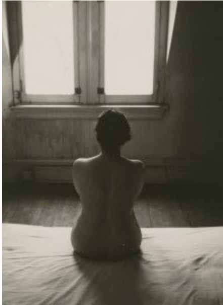
Harry Callahan Eleanor, Chicago, 1948 gelatin silver print overall (image): 11.59 x 8.5 cm (4 9/16 x 3 3/8 in.) National Gallery of Art, Washington, National Gallery of Art, Washington, Gift of Joyce and Robert Menschel