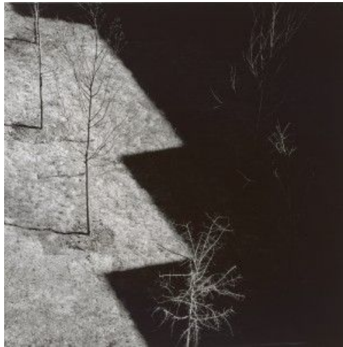
Harry Callahan Ansley Park, Atlanta, 1992 gelatin silver print overall (image): 15.72 x 15.72 cm (6 3/16 x 6 3/16 in.)