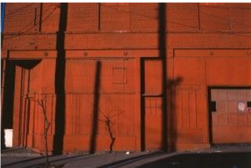
Harry Callahan Kansas City, 1981 dye imbibition print overall (image): 24.3 x 36.7 cm (9 9/16 x 14 7/16 in.) National Gallery of Art, Washington, Gift of The Very Reverend and Mrs. Charles U. Harris