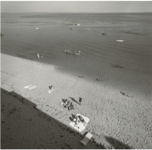
Harry Callahan Cape Cod, 1972 gelatin silver print overall (image): 23.7 x 23.9 cm (9 5/16 x 9 7/16 in.) National Gallery of Art, Washington, Gift of Joyce and Robert Menschel