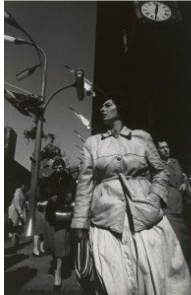
Harry Callahan Eleanor, New York, 1945 gelatin silver print overall (image): 21.2 x 16.83 cm (8 3/8 x 6 5/8 in.)