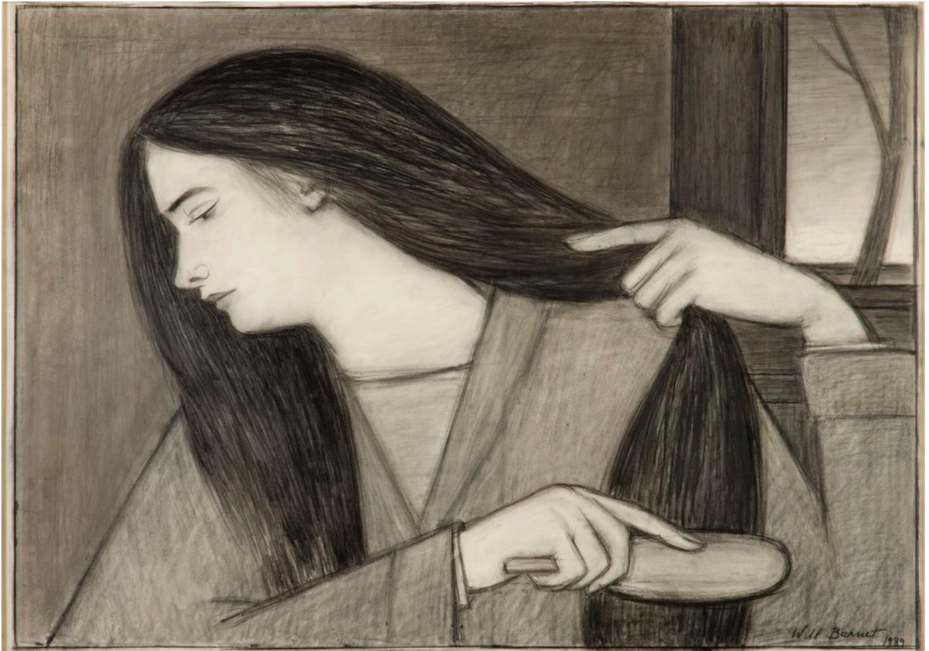
E.D. Poem 1989