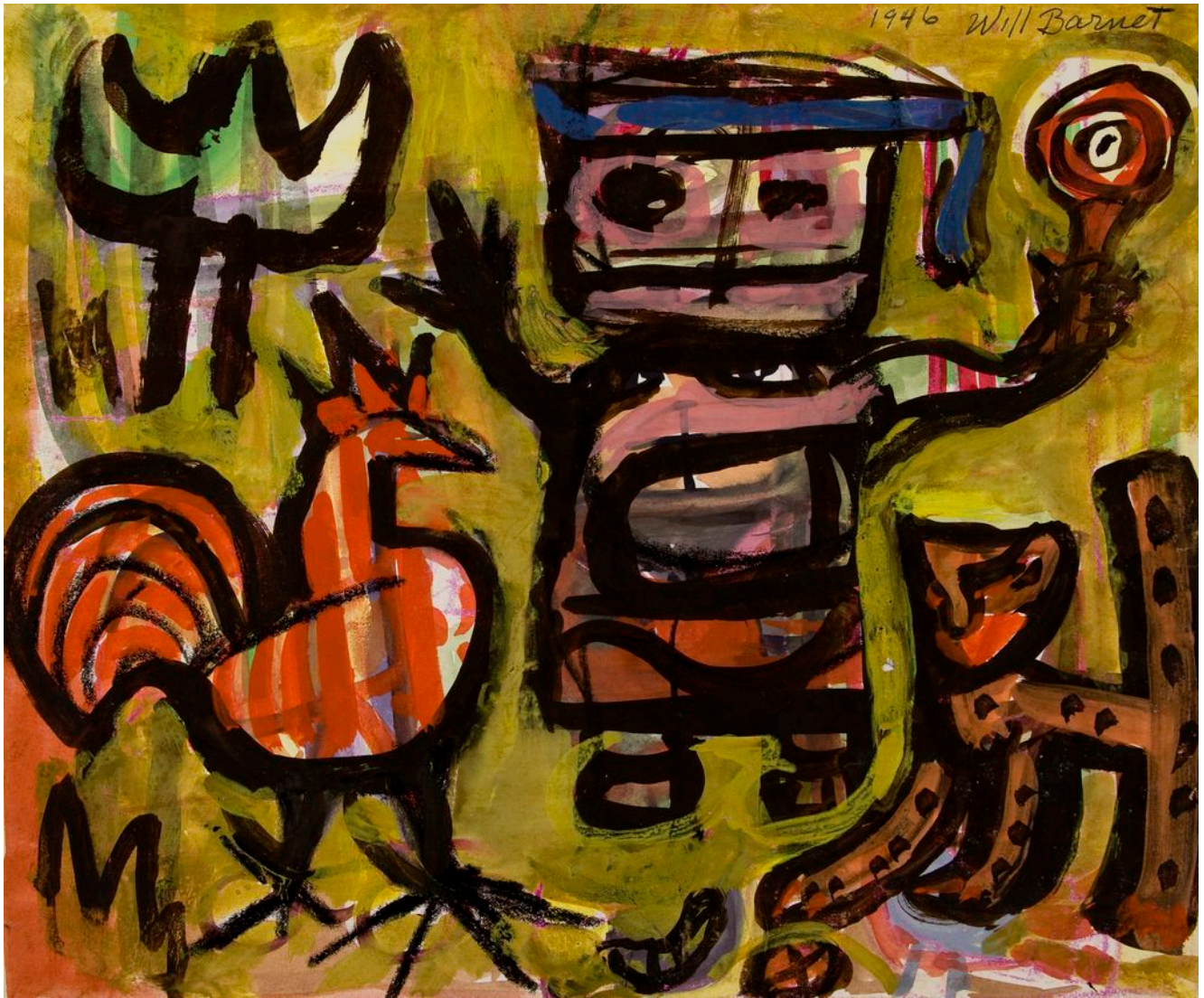
A Peaceable Kingdom 1946

Art by Will Barnet © Will Barnet, courtesy Alexandre Gallery, New York.