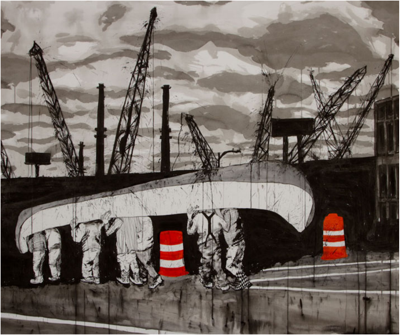
Roadtrip, 2012, ink and acrylic on paper, 40.5 x 48 inches