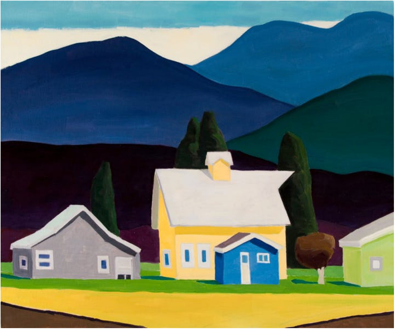
David Ridgway "Big Yellow Barn" 30x 36 Oil on Canvas