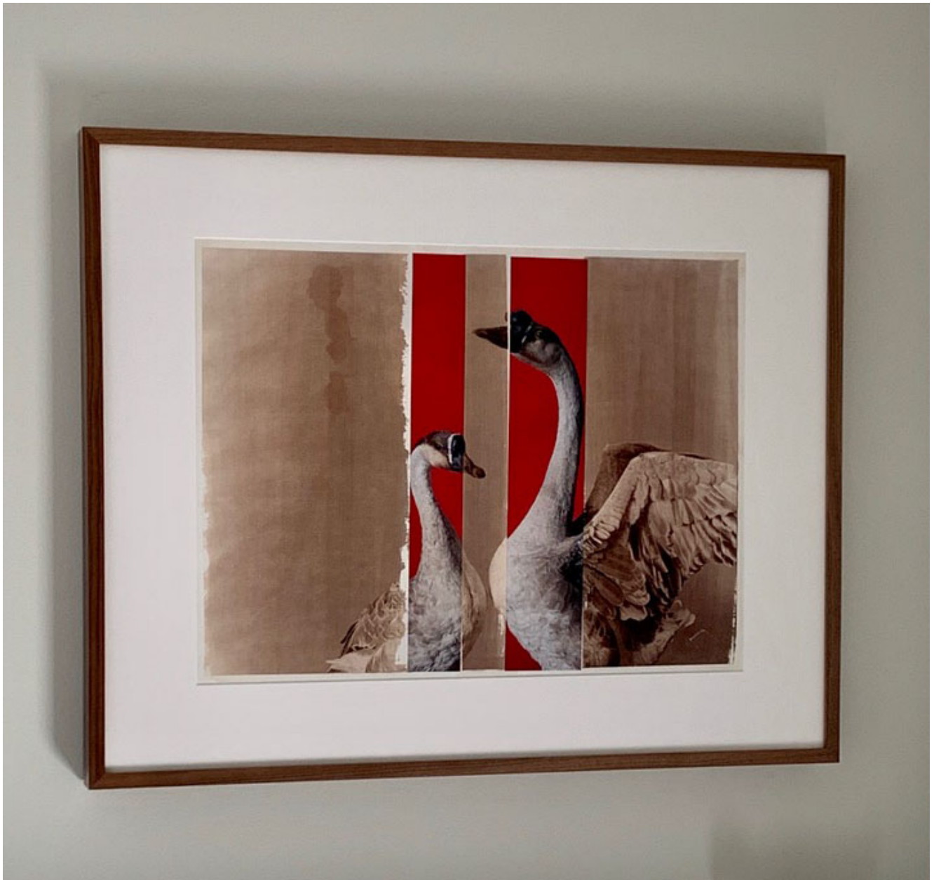
Supreme Champion Goose Male/Female (wing detail)

2018 Minnesota State Fair, salt print over archival pigment print, 20 x 24 inches, 2019