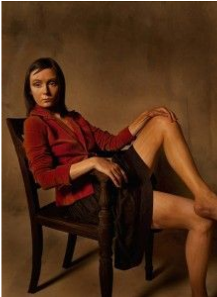
Libby After Therese (Balthus' Therese)