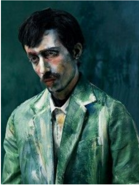
Owen After Peasant (Cezanne's Peasant)