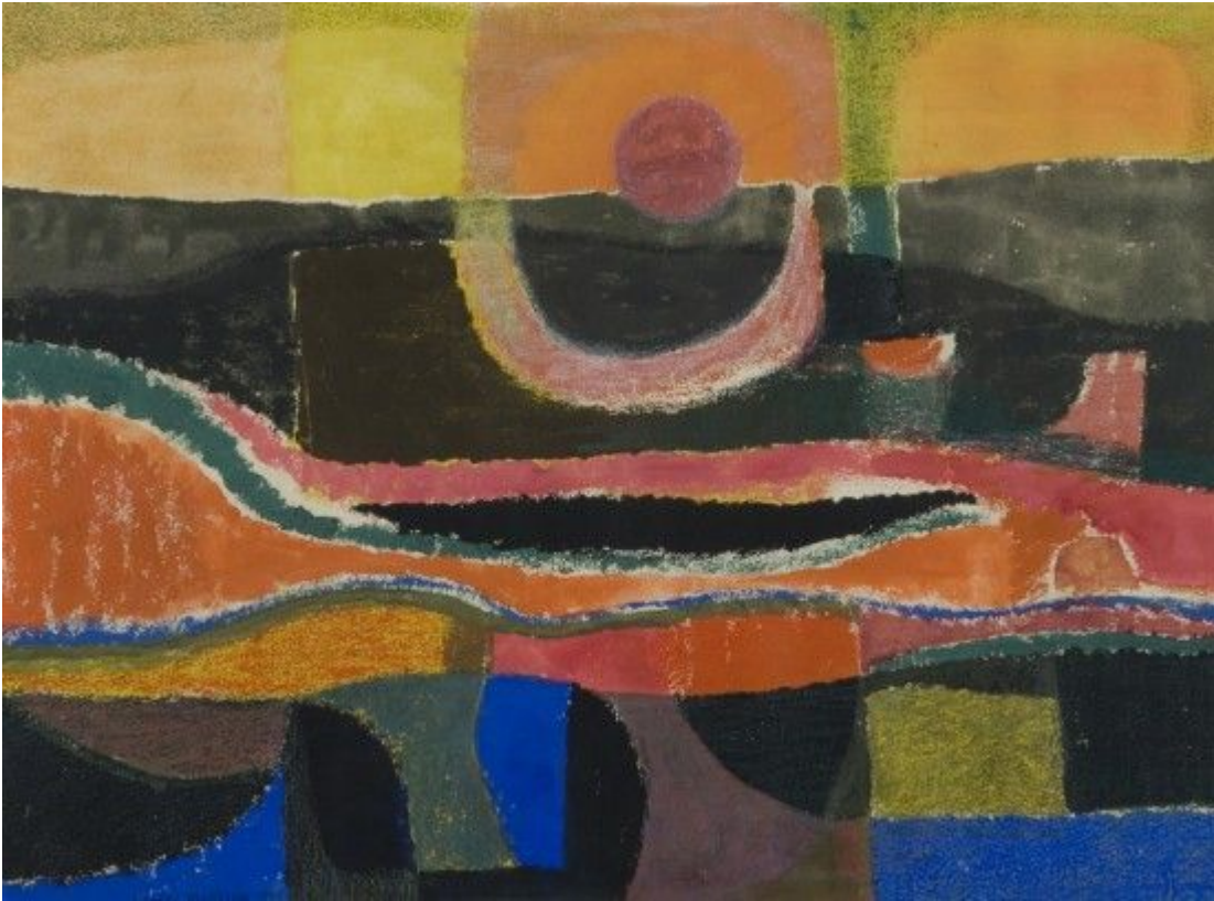
Sun and River, 1949, watercolor and crayon on paper, 15 3/4 x 21 in. Copyright Plains Art Museum. From the permanent collection of the Plains Art Museum, Fargo, North Dakota.