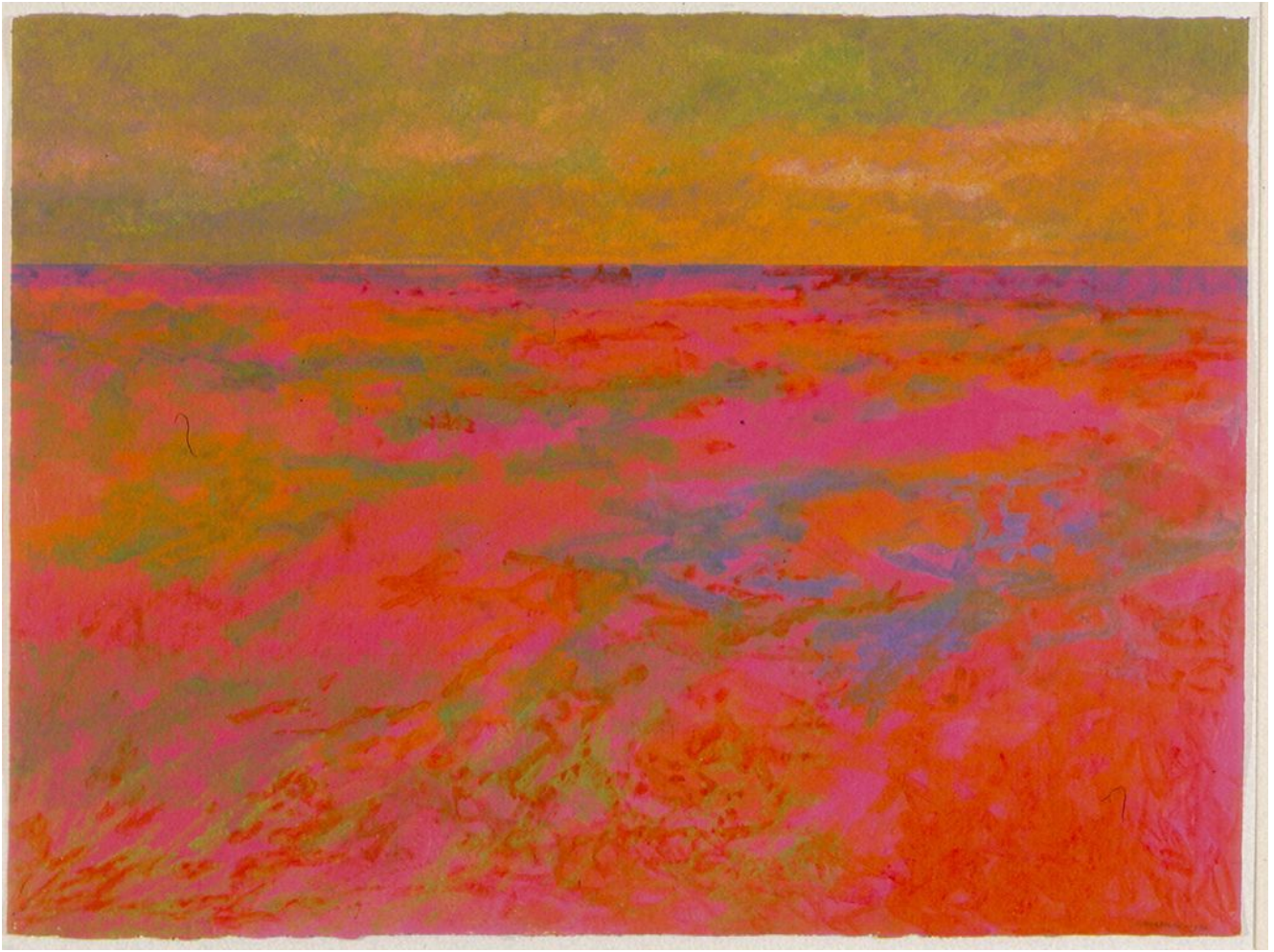
Spirit Path, New Day, Red Rock Variation: Lake Superior Landscape, 1990, acrylic and pastel on paper, 22 1/2 x 30 1/8 in. Collection Minnesota Museum of American Art.