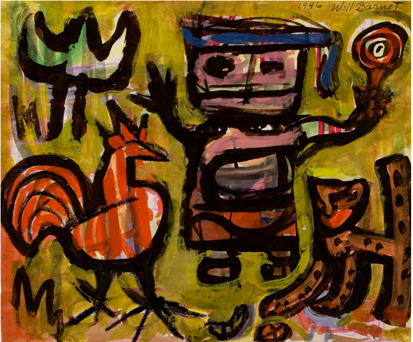
A Peaceable Kingdom 1946

Art by Will Barnet © Will Barnet, courtesy Alexandre Gallery, New York.