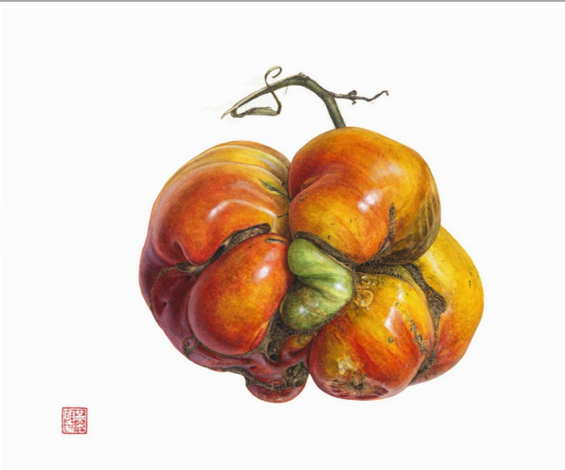
“Kind-hearted Monster” heirloom tomato, Solanum lycopersicum , Watercolor on Paper, 11” x 14” © ASUKA HISHIKI