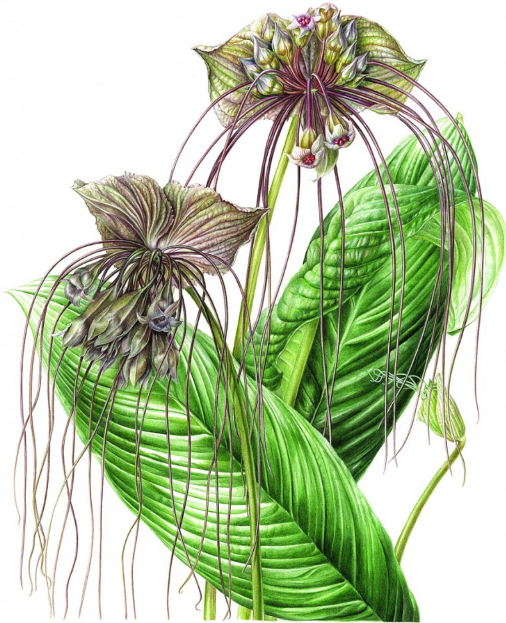
"Bat Flower/Cat's Whiskers", Tacca chantrieri , Watercolor on Paper, 20" x 16" © AKIKO ENOKIDO