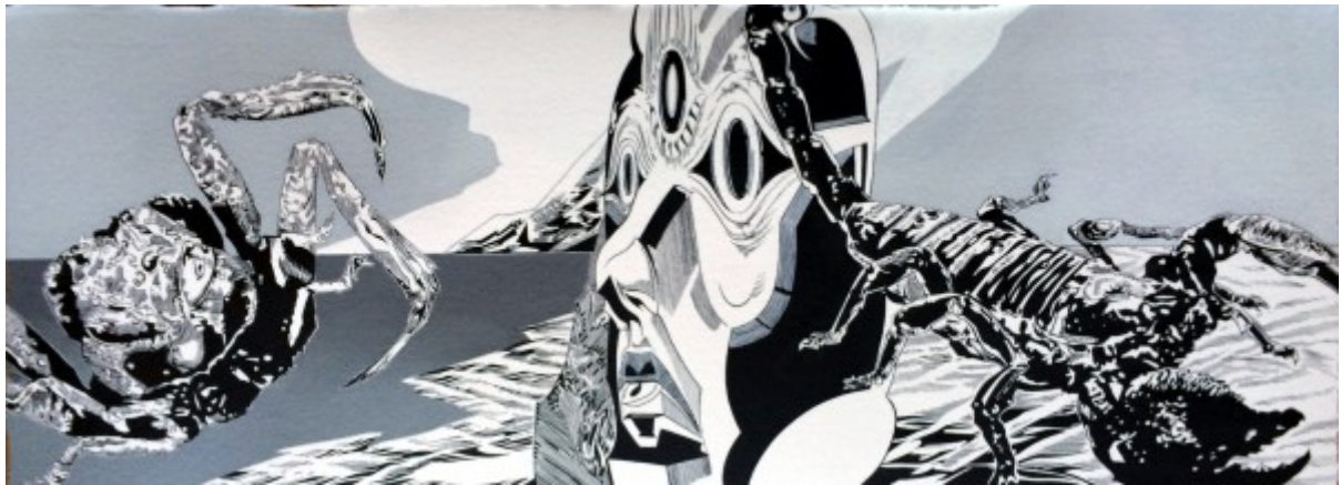
detail of 'Ink Babel' 2014 (each panel approx. 11.5" x 30") ink and oil on paper.