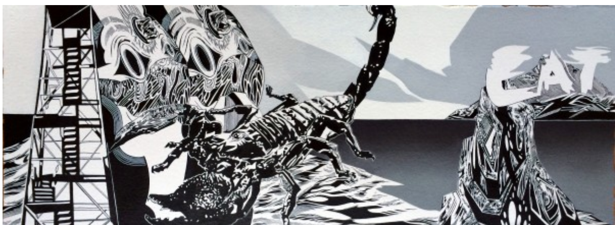
detail of 'Ink Babel' 2014 (each panel approx. 11.5" x 30") ink and oil on paper.