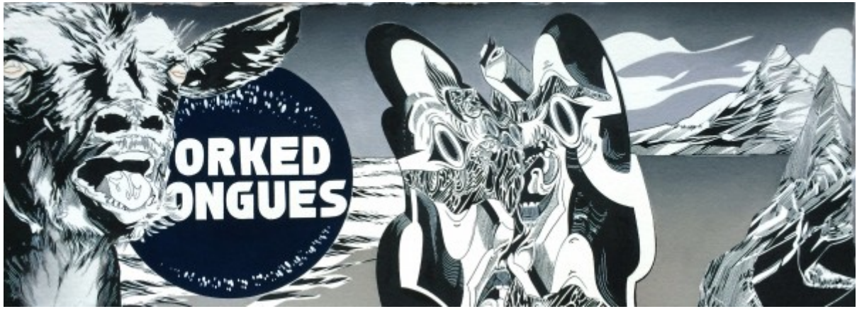
detail shot of 'Forked Tongues' 2014 (11.5" x 30") ink, oil and gouache on paper