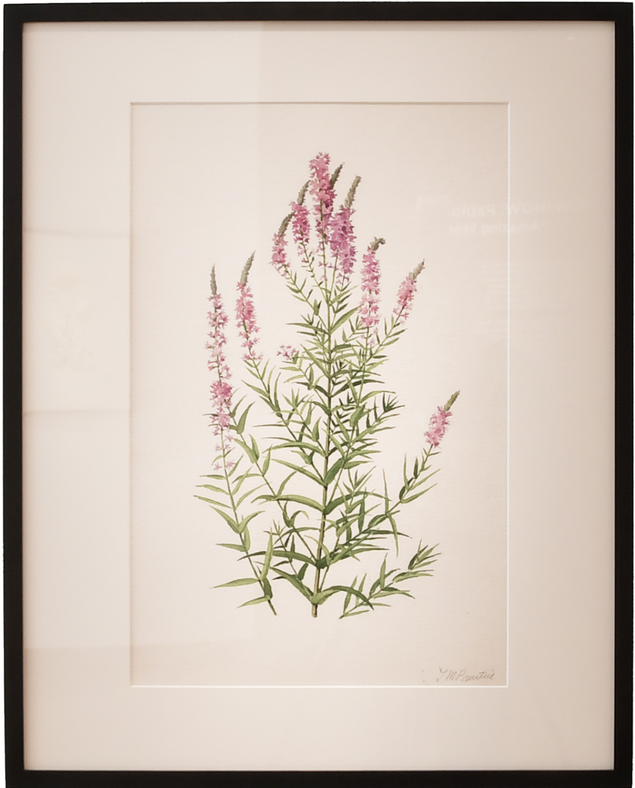
Purple Loosestrife 1971, Watercolor 1977.77.88.