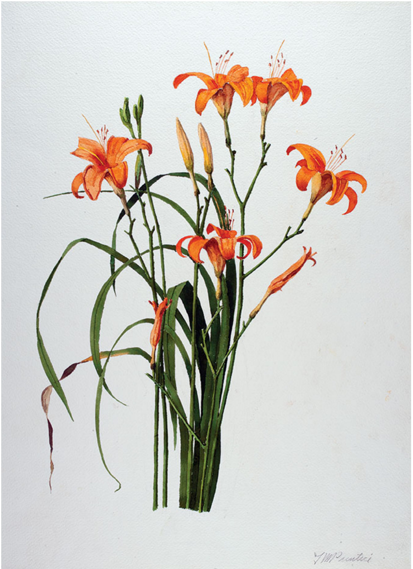
T. Merrill Prentice (1898–1985), Day Lily , 1969, Watercolor, 24 x 18 1/8 in., New Britain Museum of American Art, Gift of