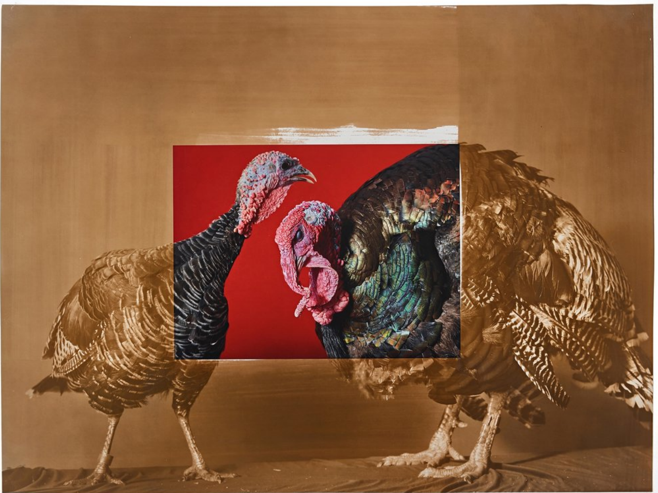
Supreme Champion Turkey Male / Female Pair, 2018 Minnesota State Fair, salt print over archival pigment print, 20 x 24 inches, 2019

The color red is a unifying element and a nod to French photographer Nadar (Gaspard-Félix Tournachon, 1820–1910), who used the color in marketing his work. Historically, the color red has represented life, health, and victory. It also symbolizes a shared characteristic between the animals: the color of blood, whose principal ingredient is salt- an essential element for mammals and birds, that also propelled the evolution of photography.