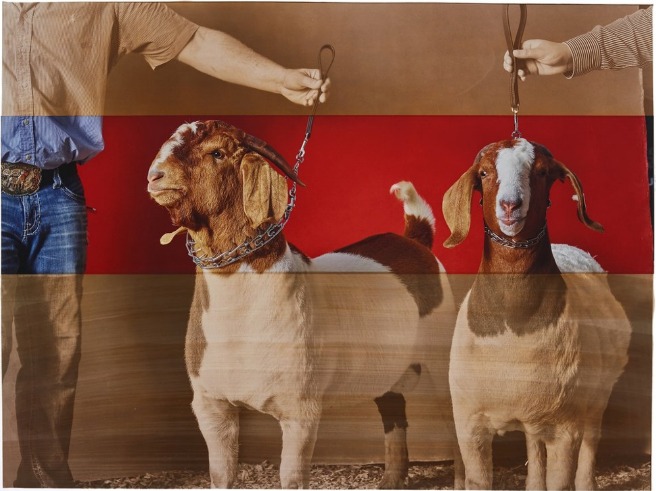
Supreme Champion Boer Goat Male / Female Pair 2018 Minnesota State Fair, salt print over archival pigment print, 20 x 24" 2019