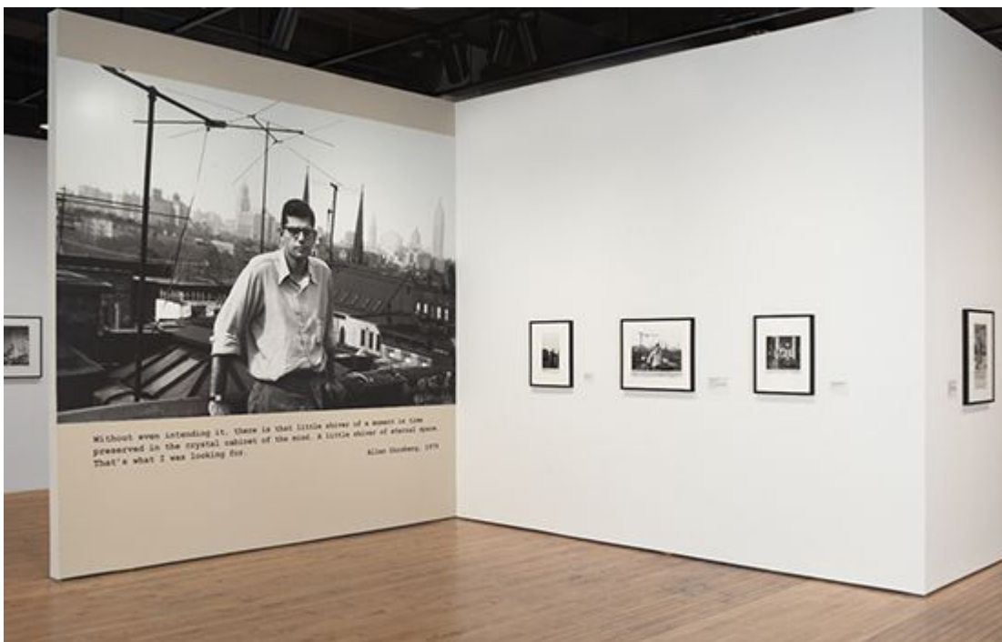
Beat Memories: The Photographs of Allen Ginsberg

Poet, mystic, and spokesman for the Beat generation, Allen Ginsberg also photographed his friends and lovers over the years. He made albums of these photos, with elaborate hand-written captions. Allen Ginsberg's photographs will be on view at the Grey Art Gallery at NYU from January 15 – April 6, 2013.